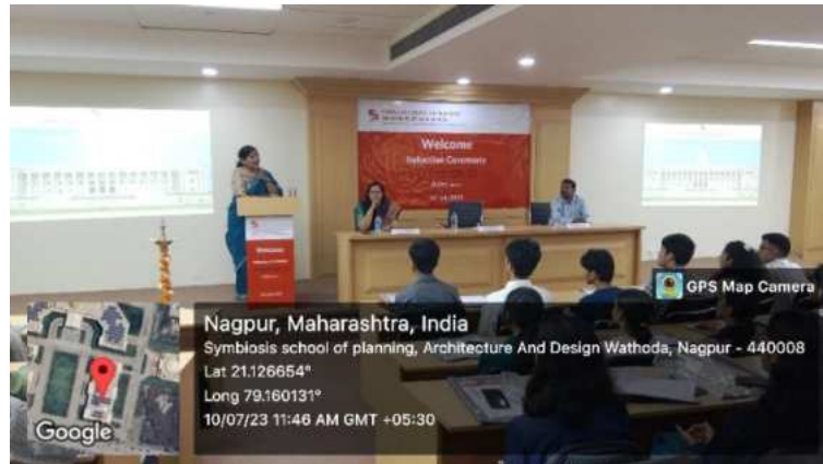
Speech by Dy. Director SSPAD

Symbiosis International (Deemed University)