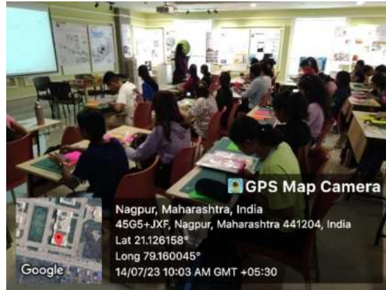
Day 4- Workshop on Modular Origami

Symbiosis International (Deemed University)