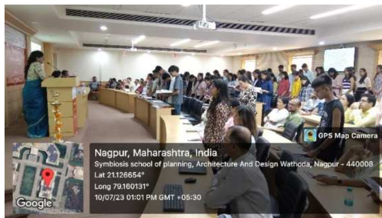
Pledge Taking Ceremony for new Students