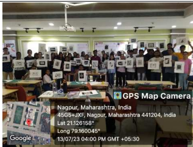
Day 3- Workshop on Print Making