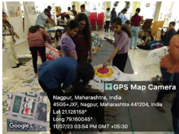
Day 1- Workshop on “Calligraphy”

Symbiosis International (Deemed University)