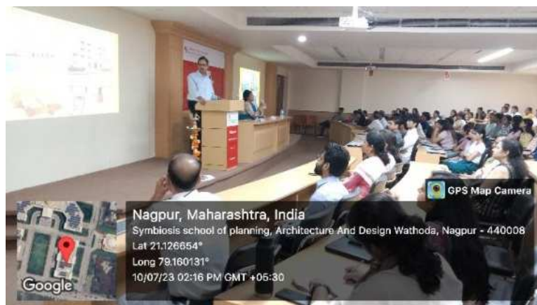
Speech by Campus Administrator, SIU