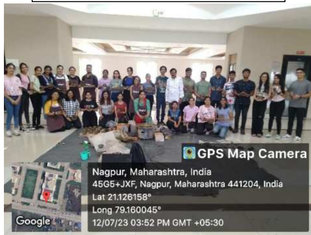
Day 2- Workshop on Clay Modeling & wheel pottery