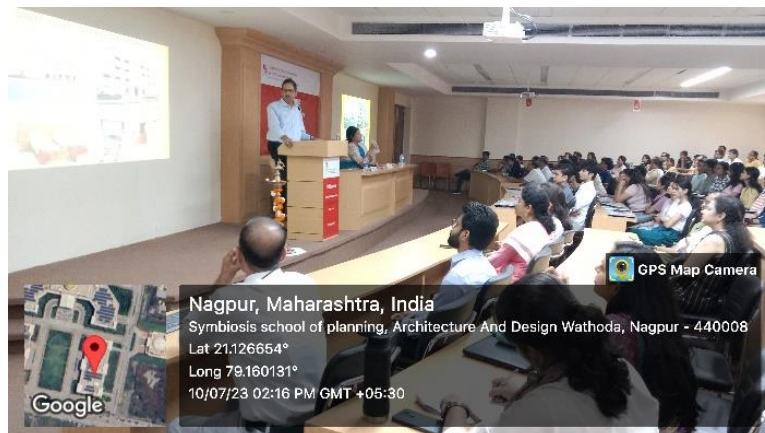
Speech by Campus Administrator, SIU