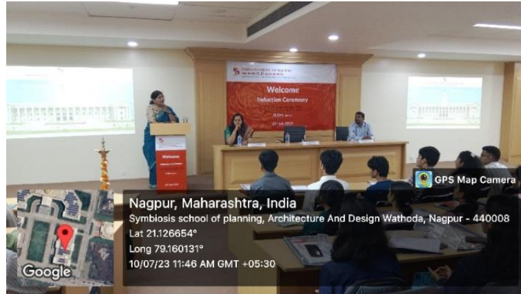
Speech by Dy. Director SSPAD

Symbiosis International (Deemed University)