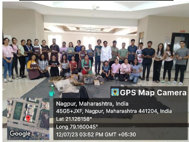
Day 2- Workshop on Clay Modeling & wheel pottery