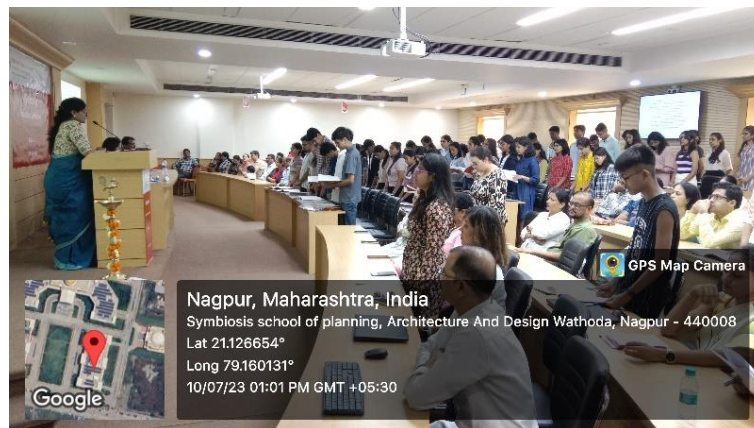
Pledge Taking Ceremony for new Students