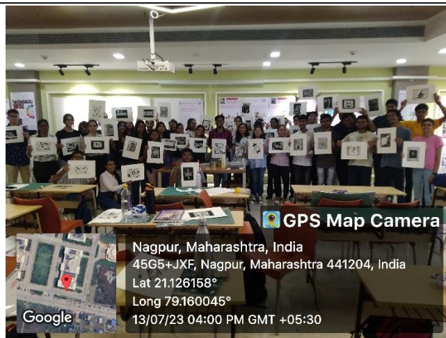
Day 3- Workshop on Print Making