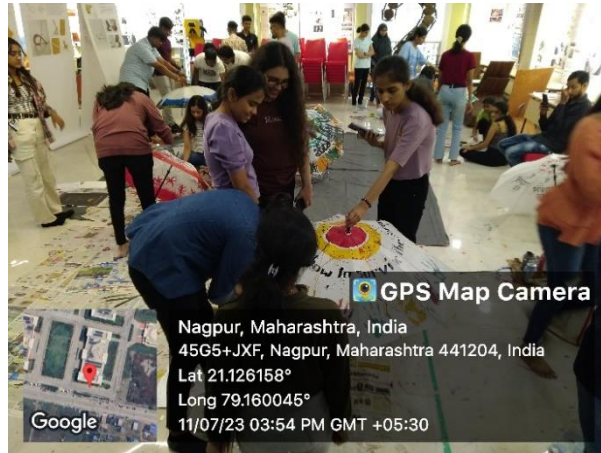
Day 1- Workshop on “Calligraphy”

Symbiosis International (Deemed University)